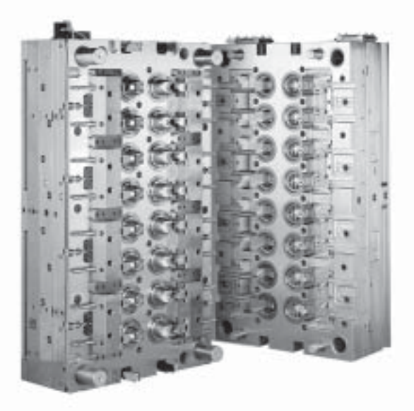
Uddeholm RoyAlloy is the preferred steel of choice of many mould makers and end users. Uddeholm RoyAlloy provides enhanced machinability, improved dimensional stability and superior surface finishes compared with AISI 420F/W-Nr. 1.2085 type of steel.

Uddeholm RoyAlloy is intended for use in prehardened conditon (i.e. delivery condition), no further heat treatment is generally required.